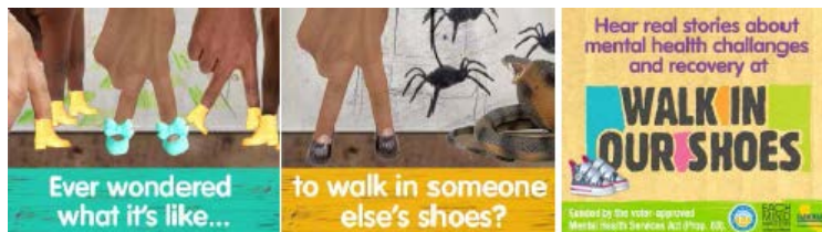
Digital Banner Ad